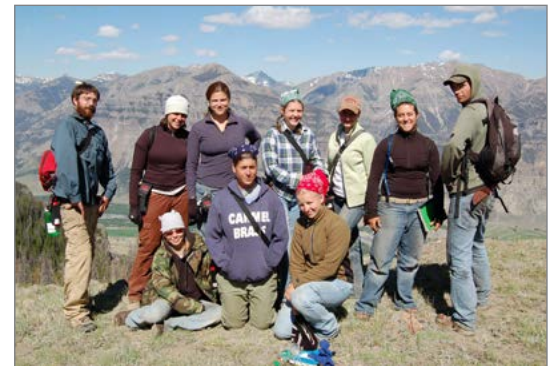
Bighorn Archaeology Fieldschool

This summer will be year five of the "Revealing Cahokia's Religion" project. This year will be examining 1000-year-old habitation sites around the Emerald Shrine center