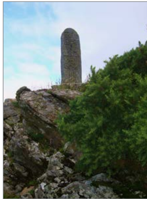
Standing stone and cairn, station 2, Glencolmcille